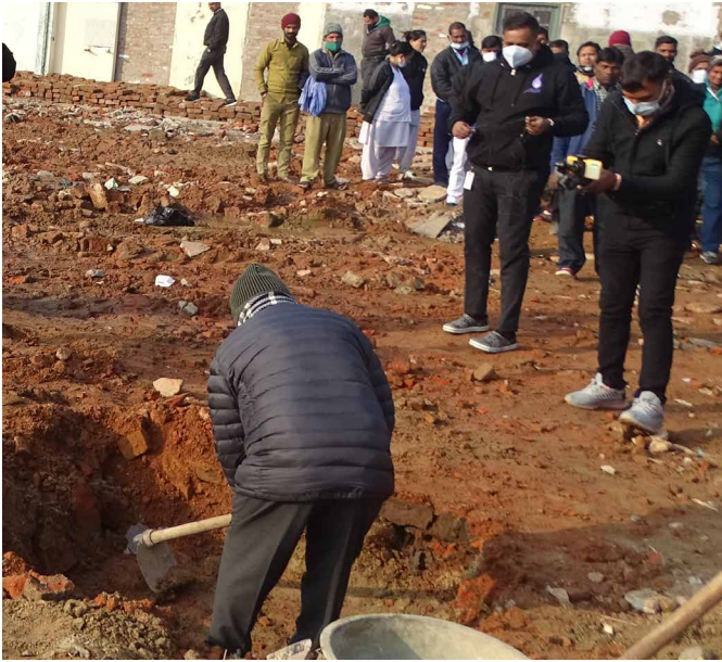
Breaking ground for the new College of Nursing at Duncan Hospital, Bihar, India.