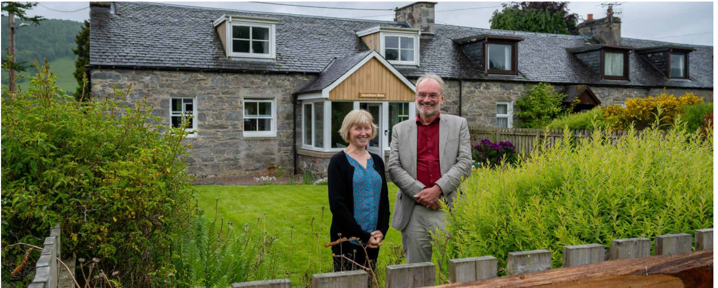
Opening of Hawthorn Brae holiday house for respite breaks at Blair Atholl, Scotland