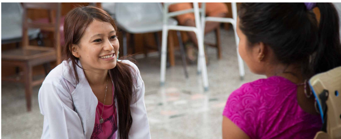
Practical training in palliative care for healthcare workers in Nepal