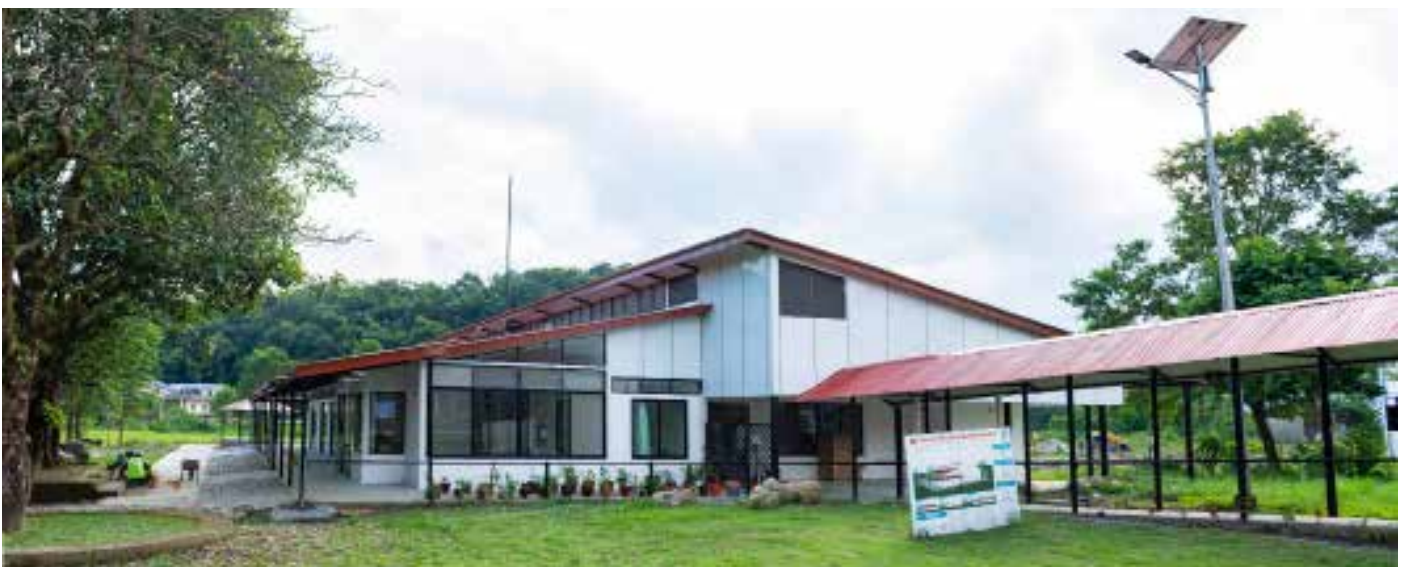
Palliative Care Centre of Excellence at Green Pastures Hospital, Pokhara, Nepal