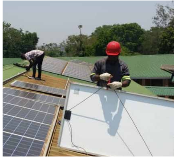
Upgrading solar power at Mulanje Mission Hospital, Malawi