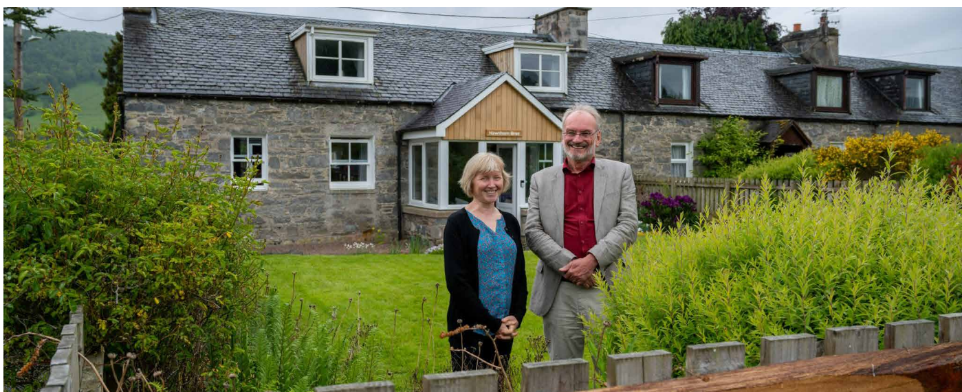
Opening of Hawthorn Brae holiday house for respite breaks at Blair Atholl, Scotland