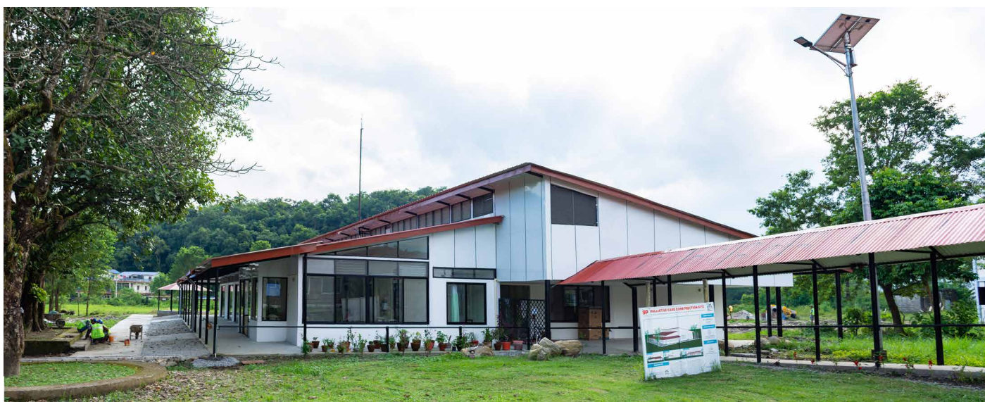
Palliative Care Centre of Excellence at Green Pastures Hospital, Pokhara, Nepal