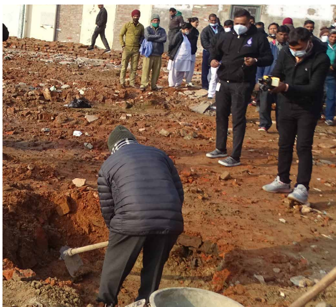
Breaking ground for the new College of Nursing at Duncan Hospital, Bihar, India.