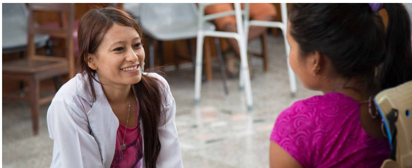
Practical training in palliative care for healthcare workers in Nepal