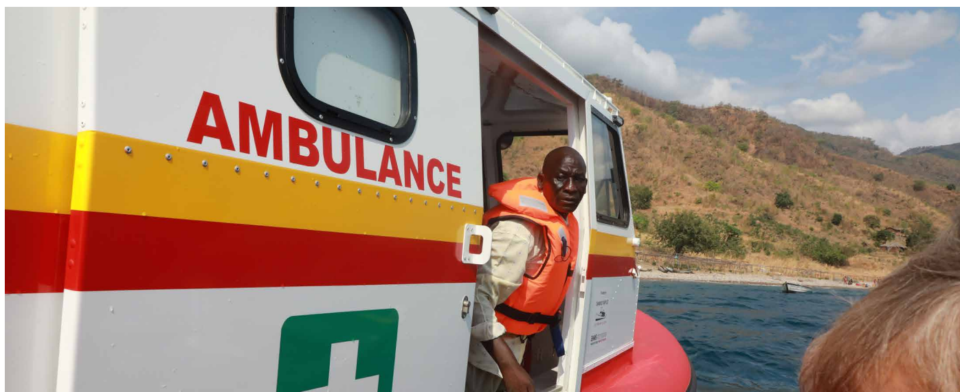
A speedboat ambulance on Lake Malawi improves access to healthcare for isolated lakeside communities