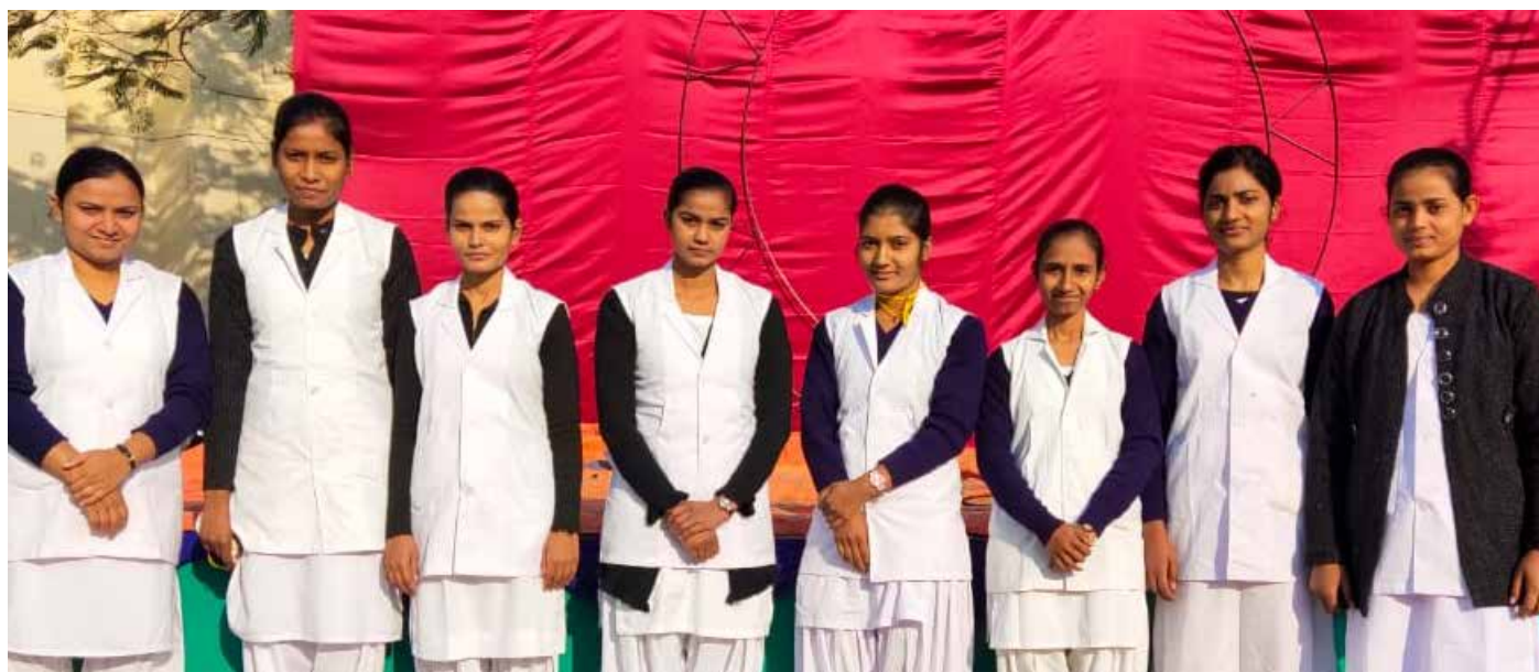
Eight young women start working at Duncan Hospital in Bihar, India, following their EMMS-sponsored training