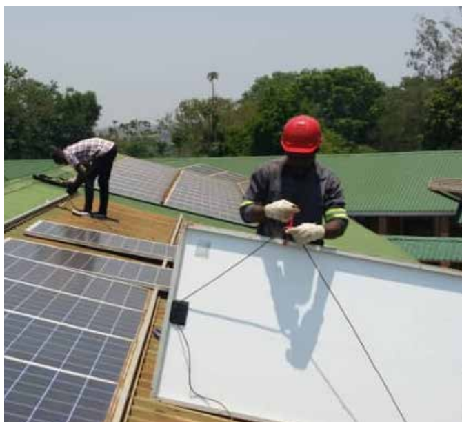
Upgrading solar power at Mulanje Mission Hospital, Malawi